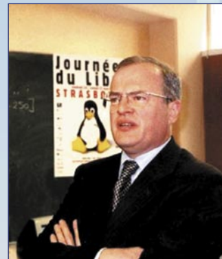
M. le Ministre Christian Pierret

For his outstanding scientific research, leading to Asia's Green Revolution. His promotion of new seed varieties and sound principles of sustainable agriculture reminds scientists and politicians worldwide of their responsibilities for stewardship of nature and humanity on our common Planet Earth.